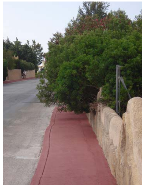
An example of the problem

At the Council meeting 9 th June 2009, a revision of the environmental by-laws was passed. (Subject to requisite waiting and publication periods) Some of the 38 page document containing 182 sections was amalgamating several by-laws into one comprehensive document, but there many new additions to this document closing some, if not all, of the previous loopholes and omissions.